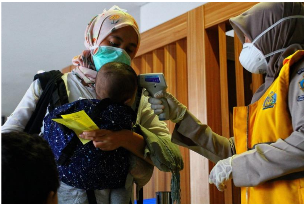
Officers check a baby's body temperature during his arrival at Indonesia's Yogyakarta Adisutjipto Airport on 5 March, 2020. Checks are carried out to prevent the entry of COVID-19 into the city of Yogyakarta, a tourist destination.

From 12–20 March 2020, a brief secondary data analysis and write-up was undertaken to analyse and explore the current and potential gendered dimensions of the COVID-19 pandemic. The report provides recommendations for the humanitarian system and humanitarian actors to ensure consideration of the gendered dimensions of risk, vulnerability, and capabilities in response and preparedness to this crisis, with a lens toward enabling support for existing humanitarian needs. This report does not aim to answer questions about the epidemiology and pathology of COVID-19.