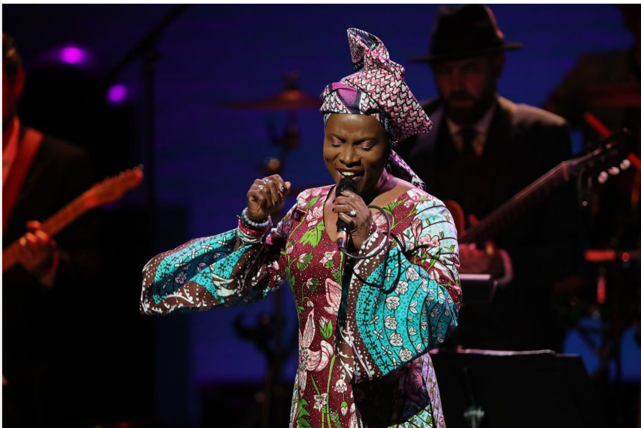
Angélique Kidjo reworks Miriam Makeba's classic 'Pata Pata' for COVID-19 awareness.